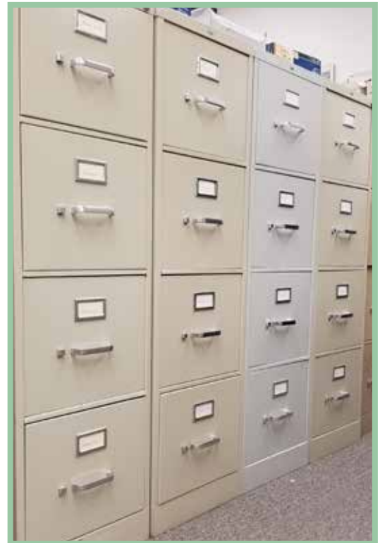
Four drawer filing cabinets donated by The Henderson Group for use by the Mequon-Thiensville Historical Society.