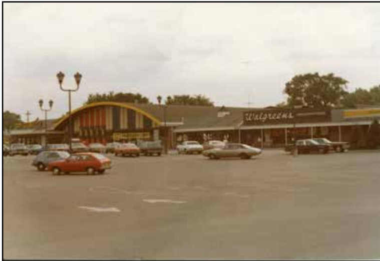
Image of Bonnywell Village Shopping Center in Thiensville. (c. 1975)

For the past two years, we have been watching the new Town Center come to life on the corner of Mequon and Cedarburg Roads. The buildings on the corner provide shopping, eateries, medical and personal services and apartments. And future developments are on drawing boards for more Town Center construction to come.