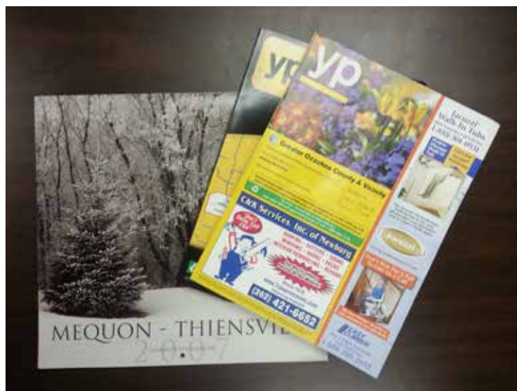
2007 Mequon-Thiensville calendar and local yellow page phone books donated by Bonnie Heintskill.

Correction: Pictures 2 & 3 of the Fall 2015 issue belong to Bernadine Szepinski's photo collection of family photos.