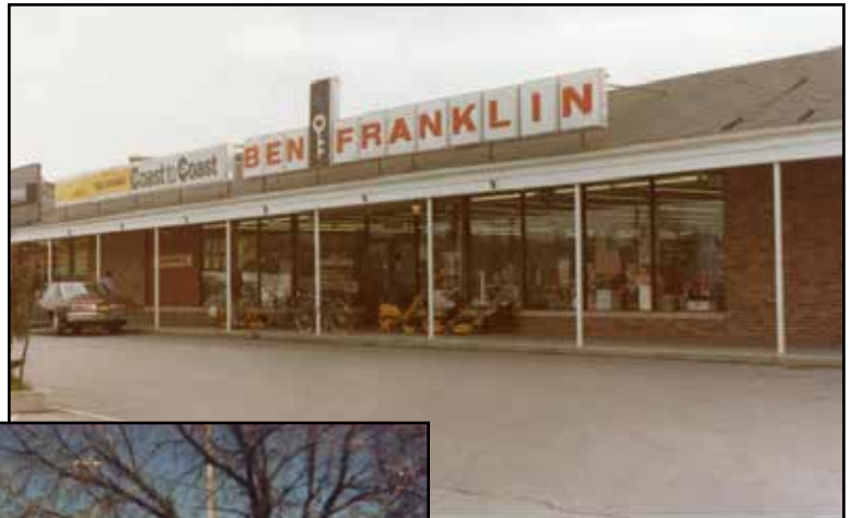
Shopping center in Thiensville including Coast to Coast and Ben Franklin store.

Strip mall on west side of Main Street in Thiensville including Sentry Foods, Red Wheel dress shop, Loppnow's Drugs, Warehouse Shoes, and other retail establishments.