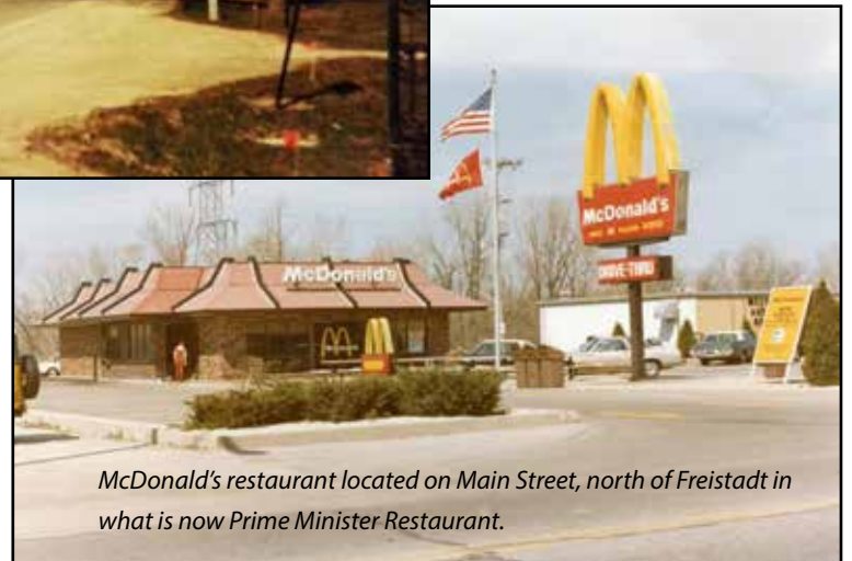
McDonald's restaurant located on Main Street, north of Freistadt in what is now Prime Minister Restaurant.