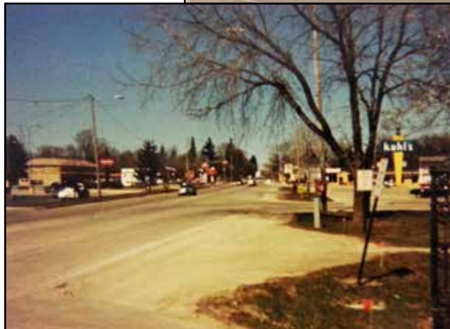
Thiensville looking north on Main Street. Notice Kohl's Food Store sign on the right in the background.