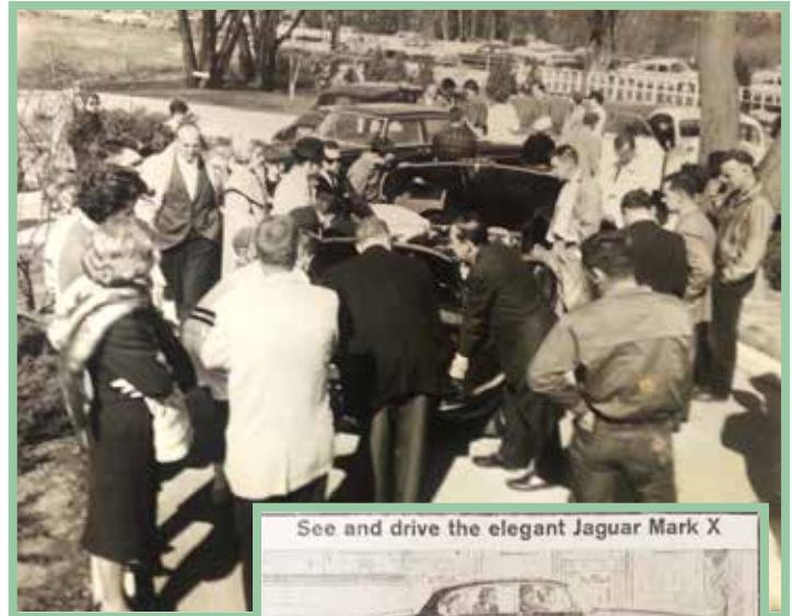
Milrace Motors event in Thiensville at the Willowbrook shops. Image circa 1961.