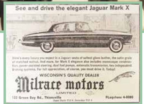
Milrace Motors advertisement. Image circa 1961.