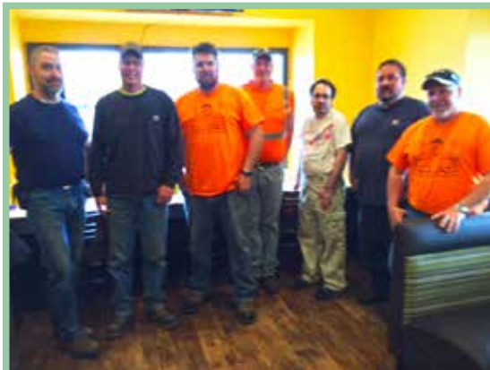
Images of City of Mequon Parks and Recreation volunteers who moved MTHS to its new location.