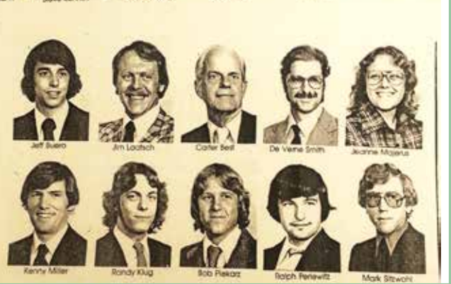
Employees of Schmidt Ford, Thiensville, 1978.