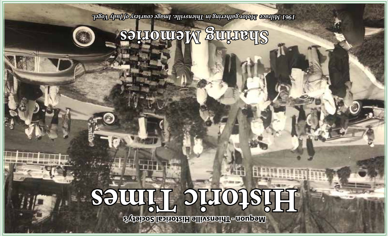
1961 Mirrae Motor gathering in Thiensville.