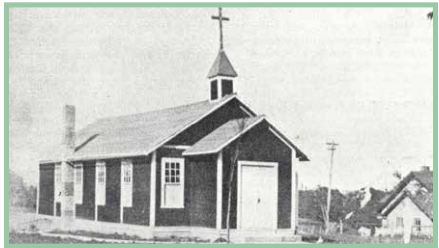
Original St. Cecilia's Catholic Church established in 1919.

During the early 1800's, Prussian King Frederick William III personally dictated the liturgy to be followed in all of his unified Lutheran churches. As you