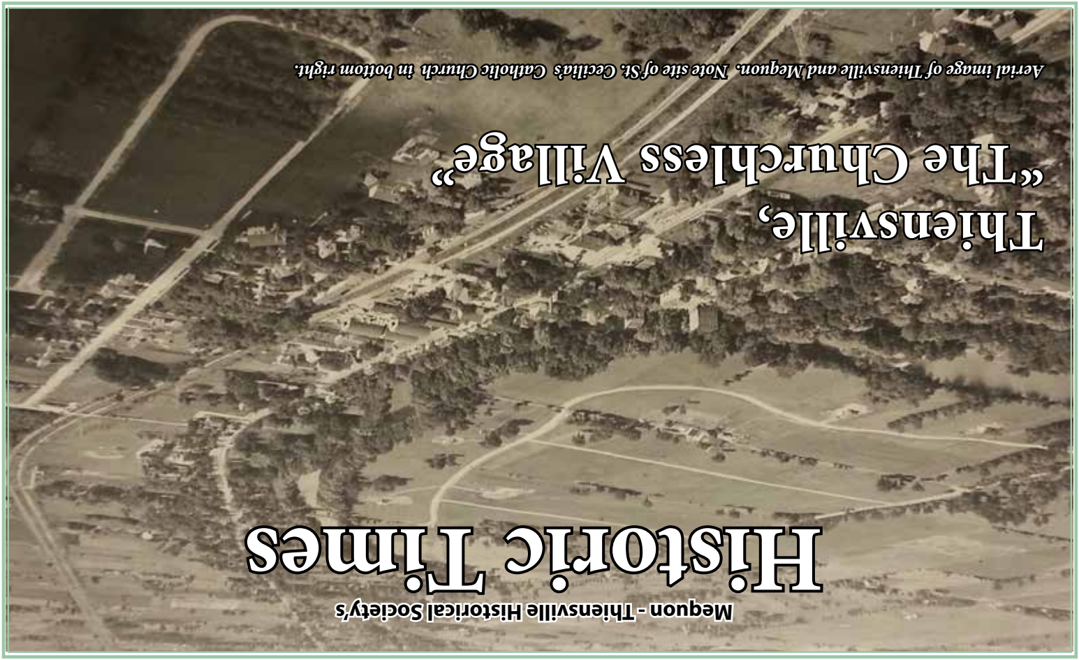
Aerial image of Thiensville and Mequon. Note site of St. Cecilia's Catholic Church in bottom right.