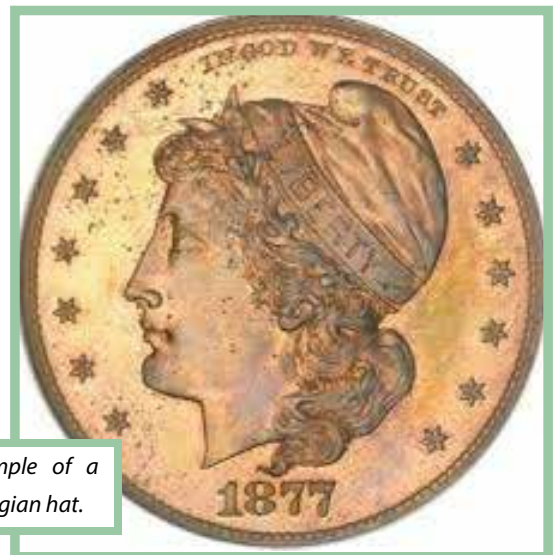
Example of a Phrygian hat.