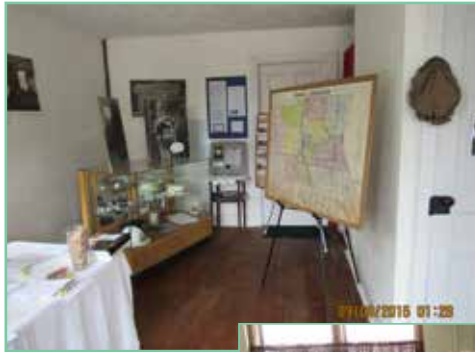
Isham Day House display for the 2015 Taste of Mequon Event on September 12th.

The pace of volunteering slowed over the summer months as people were busy with family events, travel and just enjoying life. Now that fall is upon us, our dedicated volunteers are coming back to resume their tasks, and new ones are on the horizon. MTHS always welcomes members, interested citizens, and students to help preserve the history of our area for present and future researchers.